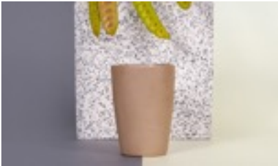
Lagos del Mundo