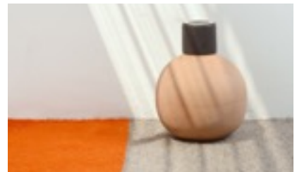
Lagos del Mundo